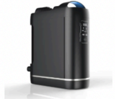
RO HYDROGEN INFUSED